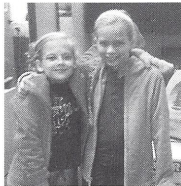
Students from St. Peter - Schulte School deliver baby items for COH families.

Shortly after providing this assistance , I received a surprise donation from St. Peter Schulte School students that collected baby items during respect life week and wanted